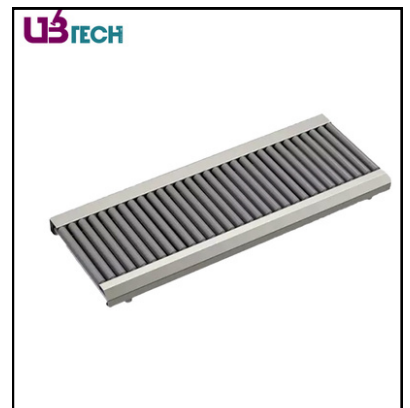
Roller Workbench USM-RW201