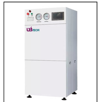
Horizontal Pressure Steam Autoclave 150/200/300/400L UST-H150I