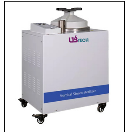
Vertical Pulse Vacuum Autoclave 50/80/100/120/150L UST-V50PV