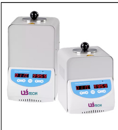
Glass Bead Sterilizer UGBS-300L