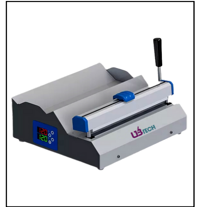
Manual Sealing Machine USM-M7A; USM-M7B