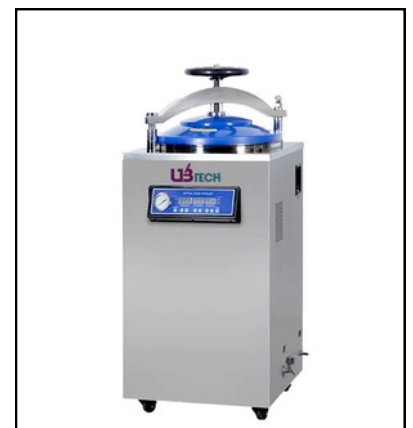
Vertical Pressure Steam Sterilizer, Self-control Drying UST-VG35