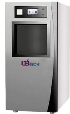
Hydrogen Peroxide Low Temperature (Plasma Sterilant Solution) UST-HT100PI