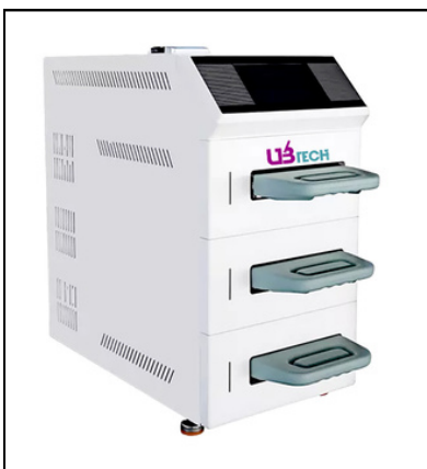
Cassette Sterilizer, Three-layer UST-2000TC