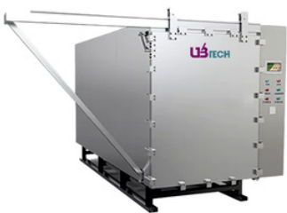
Ethylene Oxide Sterilizer UST-EO3000