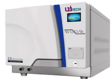
23L Ethylene Oxide Sterilizer UST-EO40