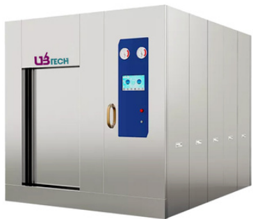
H 2 O 2 Serious Hydrogen Peroxide Steam Sterilizer UBTECH Custom model