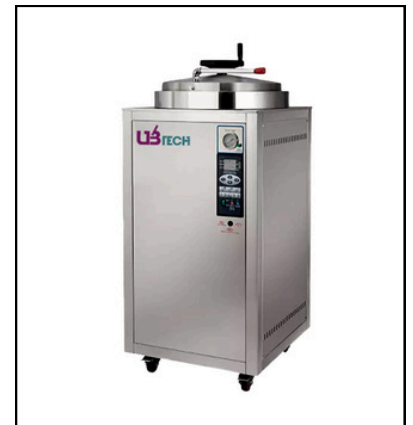
Vertical Pressure Steam Sterilizer, 150L UST-V150L