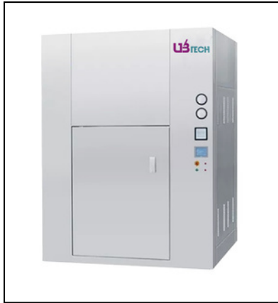
Dry Heat Sterilizer UST-DH360