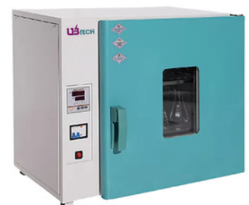
Hot Air Sterilizer ST-H Series UST-H25A