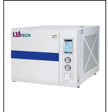
Benchtop Pulse Vacuum Autoclave, Class B UST-B60PV