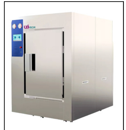
Horizontal Pulse Vacuum Autoclave, Motorised Door UST-BVA250PV