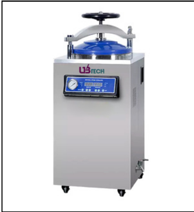
Vertical Pressure Steam Sterilizer, Digital Display Self-control UST-VB35