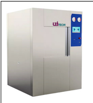
Horizontal Pulse Vacuum Autoclave UST-BVB150PV