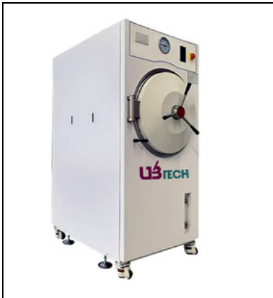
Horizontal Pressure Steam Autoclave UST-H60