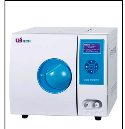
Benchtop Class B Autoclave 8/12/18/24L UST-B8B, UST-B12B