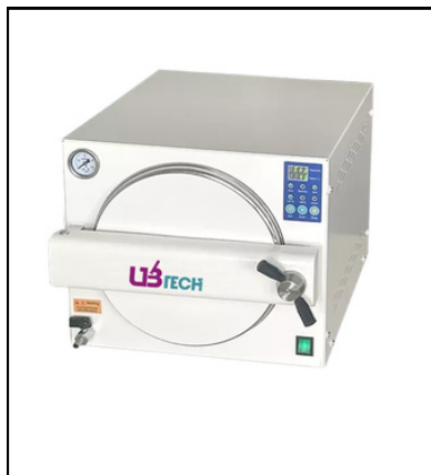
Benchtop Class N Autoclave 18/24L UST-B18NI