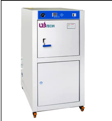
Horizontal Pressure Steam Sterilizer, 100L UST-H100YDB