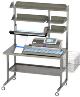
Multifunctional Workstation USM-MW210