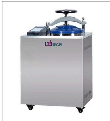
Vertical Pulse Vacuum Steam Autoclave UST-V35PVM