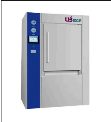
Horizontal Pulse Vacuum Autoclave, Motor Hinge Door UST-BA650PV