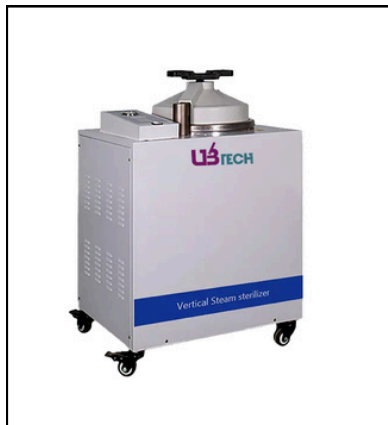
Automatic Vertical Autoclave 50/80/100/120/150L UST-V50A