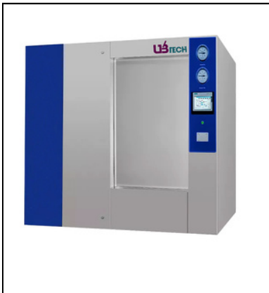
Horizontal Pulse Vacuum Autoclave, Sliding Door UST-BH1200PV