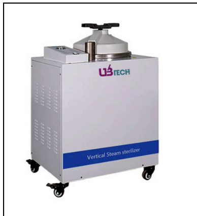
Vertical Pressure Steam Sterilizer 50/80/100L UST-V50