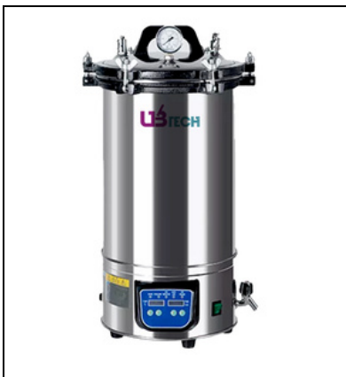
Economic Portable Autoclave UST-P18E