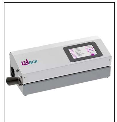
Automatic Sealing Machine, Touch Screen USM-A100R