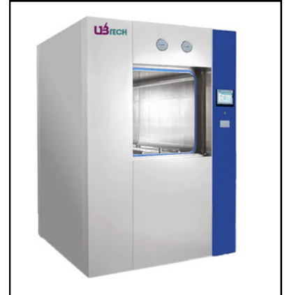
Horizontal Pulse Vacuum Autoclave with Lift Door UST-BV150PV