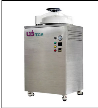
Vertical Pressure Steam Sterilizer, ST-VLA Series UST-VLA50