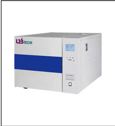
Benchtop Class B Autoclave 45L UST-B45B