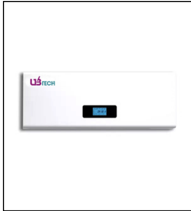
Plasma Air Sterilizer UST-PAB600