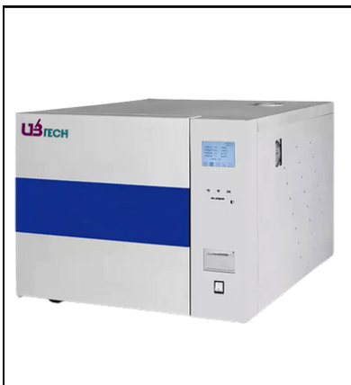
Benchtop Class N Autoclave 45L UST-B45N