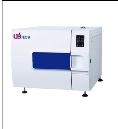
Class B Autoclave, Automatic Door UST-BA18B