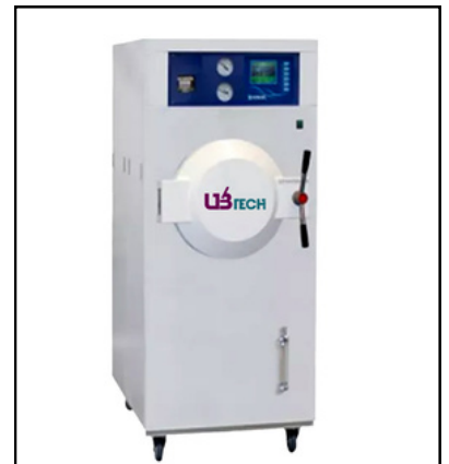
Cabinet-type Pulse Vacuum Sterilizer UST-H60PVI