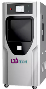
Low Temperature Formaldehyde Steam Sterilizer UST-FT100