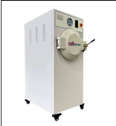
Horizontal Pulse Vacuum Autoclave 60-450L UST-H60PV