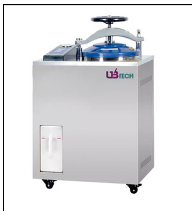
Vertical Pressure Steam Sterilizer, Internal Circulation Drying UST-VX35