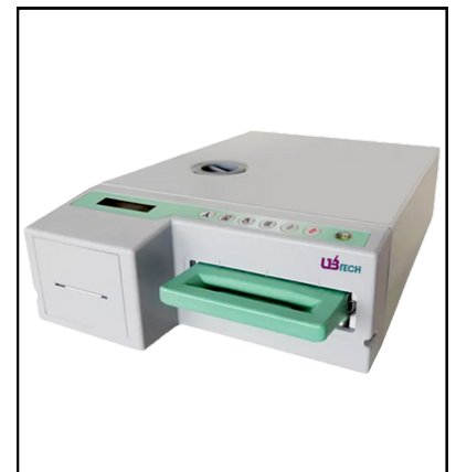
Cassette Sterilizer UST-2000C