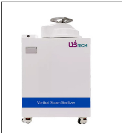
Vertical Pressure Steam Sterilizer UST-VPA50