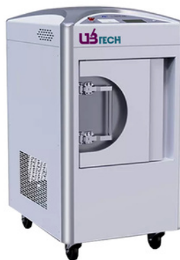
Automatic Ethylene Oxide Sterilizer UST-EO80