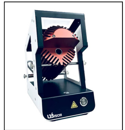
Infrared Bacti-Cinerator Sterilizer UBSC-800A