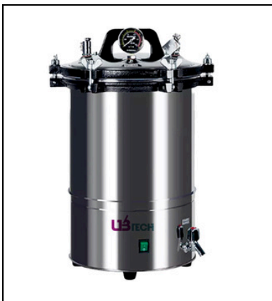
18/24L Portable Autoclave with Electric Heating UST-P18