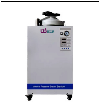
Economical Vertical Pressure Steam Sterilizer UST-V50E