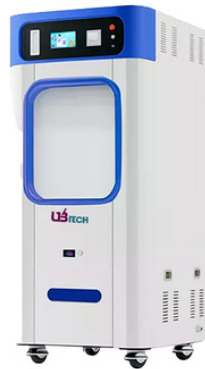
Hydrogen Peroxide Low Temperature Plasma Sterilizer UST-HT60P