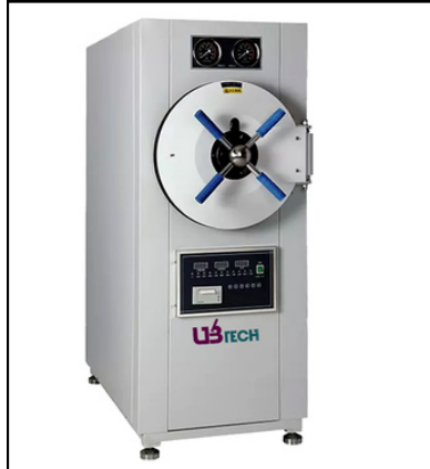
Horizontal Pressure Steam Sterilizer, 150L/200L/280L UST-H150YDB