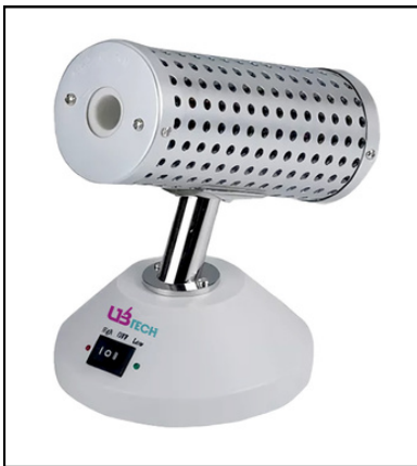
Infrared Bacti-Cinerator Sterilizer UBSC-800A