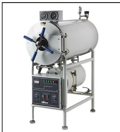
Horizontal Pressure Steam Sterilizer UST-H150YDA