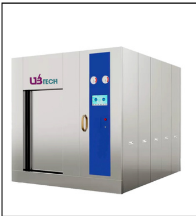
Horizontal Pulse Vacuum Autoclave Sliding Door UST-BVH1200PV

These benchtop autoclave is designed to generate and control the high temperatures required to kill micro-organisms on surfaces or in solutions of laboratory supplies. UBtech ® benchtop sterilizers are meet the most stringent CE standards.