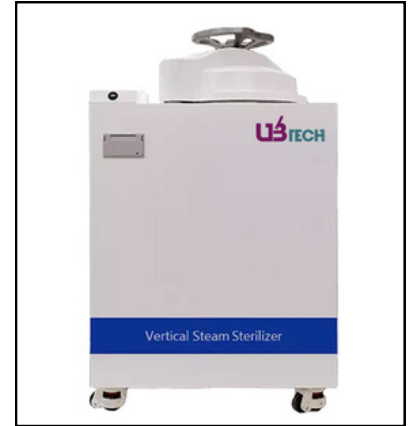
Vertical Pressure Steam Sterilizer, ST-VG Series UST-VGA50