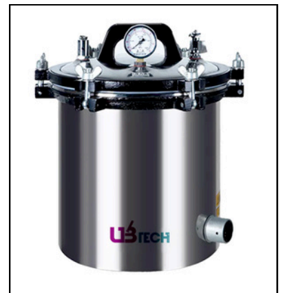
Portable Autoclave with Electric/Gas Heating UST-P18B