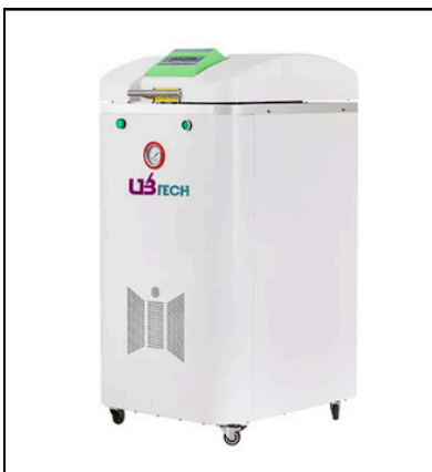
Vertical Pressure Steam Autoclave, ST-VL Series UST-VL65