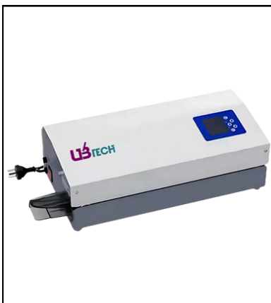
Automatic Sealing Machine USM-A100