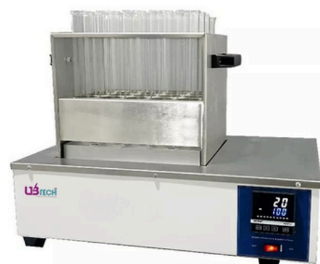
Model : UGDF-8B Graphite Digestion Furnace UGDF-8B