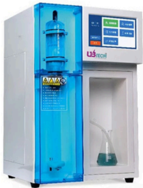
Model : UKA-9870; UKA-9870I; UKA-9870II Fully Automatic Kjeldahl Apparatus UKA-9870 Series