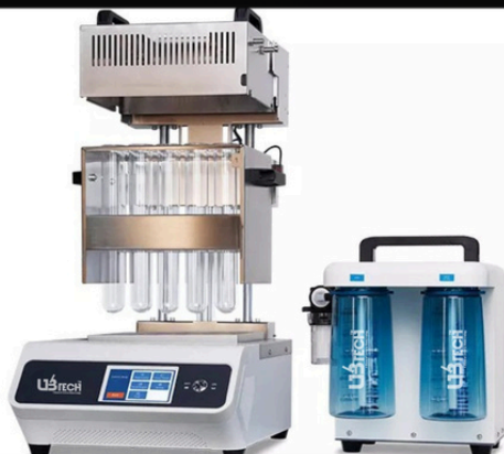
Model : UGDF-20SX; UGDF-20LX Graphite Automatic Digestion Furnace