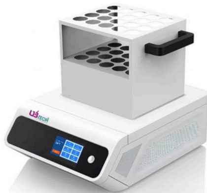
Model : UGDF-10S; UGDF-15S; UGDF-20S Graphite Digestion Furnace