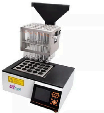
Model : UKD-420F Kjeldahl Digester