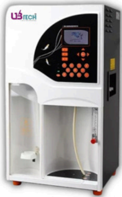
Model : UKA-9840 Economical Automatic Kjeldahl Apparatus UKA-9840