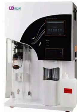
Model : UKA-9830; UKA-9830I Automatic Kjeldahl Apparatus UKA-9830 Series