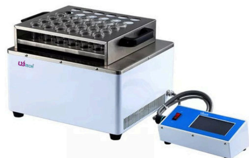
Model : UGD-36S; UGD-54S Graphite Digester