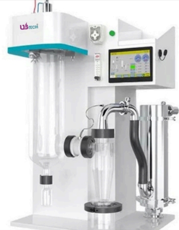
Model : USD-2 Mini Spray Dryer