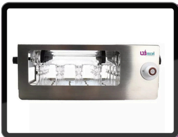
Model : UWGCH-03 Waste Gas Collection Hood UWGCH-03