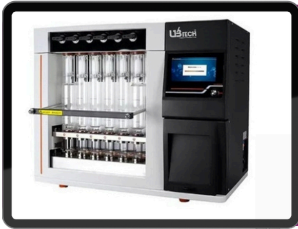
Model : UFBA-800 Fiber Analyzer