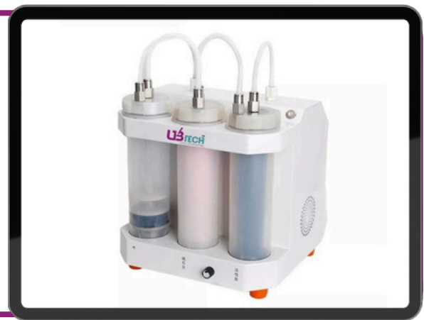
Model : UESS-402 Exhaust System Scrubber