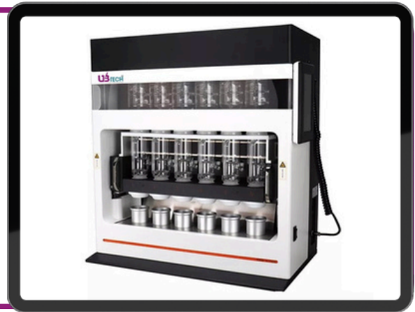
Model : UFA-406 Fat Analyzer