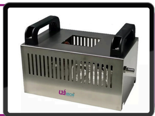
Model : UWGCH-08; UWGCH-10; UWGCH-15; UWGCH-20 Waste Gas Collection Hood UWGCH-08/10/15/20