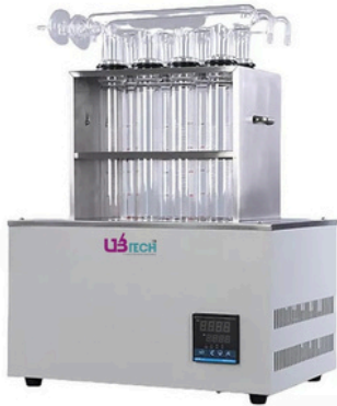
Model : UDF-04C; UDF-08C; UDF-20C Digestion Furnace, DF Series