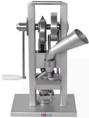
Model : USPT-M15 Manual Single Punch Tableting Machine