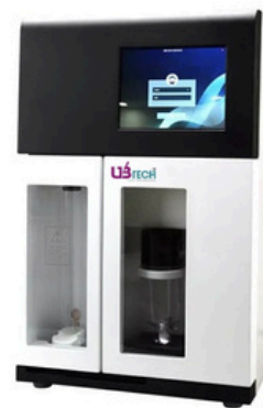
Model : UKA-1100 Fully Automatic Kjeldahl Apparatus UKA-1100