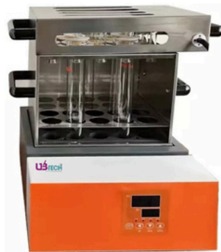
Model : UKDF-120G Kjeldahl Digestion Furnace UKDF-120G