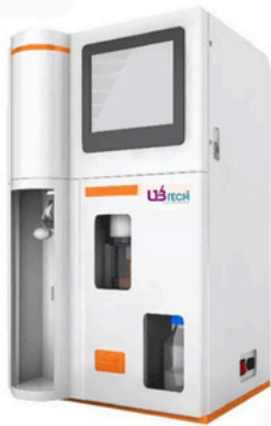
Model : UKA-580 Fully Automatic Kjeldahl Apparatus UKA-580