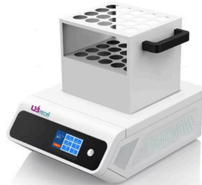
Graphite Digestion Furnace UGDF-10L/15L/20L