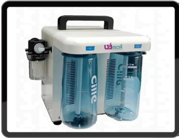
Model : UANA-1B Acid-base Neutralizing Apparatus