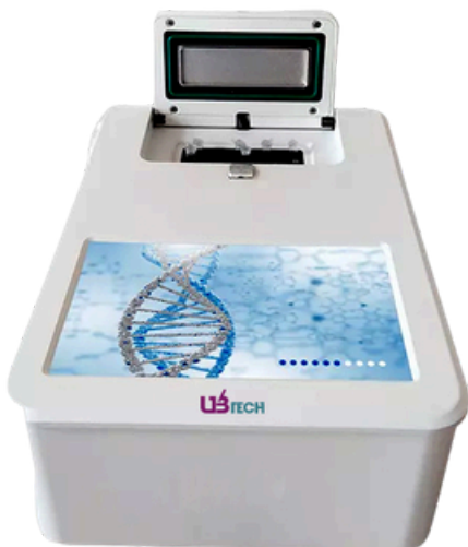
Model : UPCR-IAF16; UPCR-IAF16I

Isothermal Amplification Fluorescence PCR Detection System