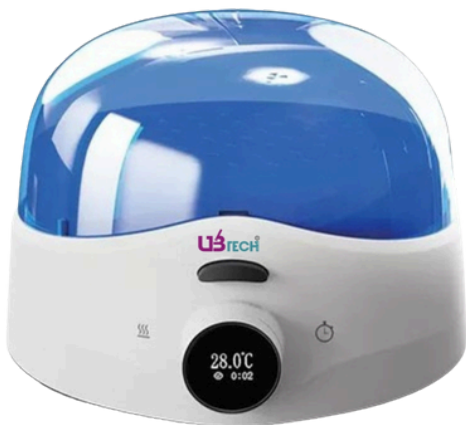
Model : UDB-H100E