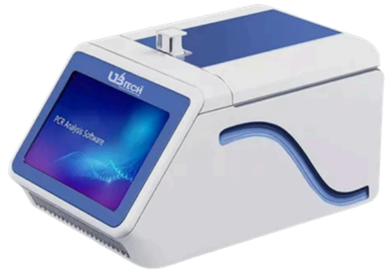
Model : UPCR-TC96M