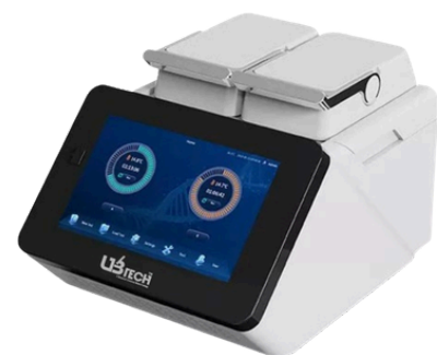
Model : UPCR-TC96SM; UPCR-TC96DM; UPCR-TC96TM