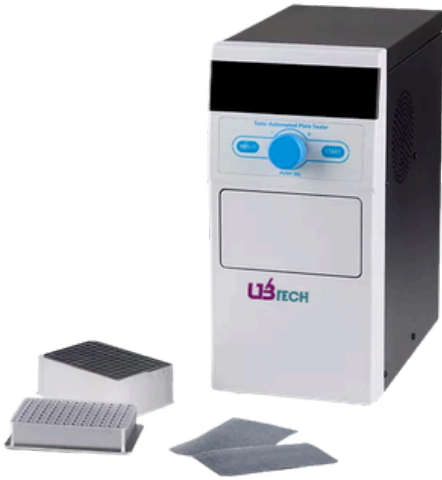
Model : UPS-SA1000