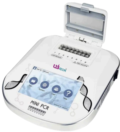
Model : UPCR-TC16;