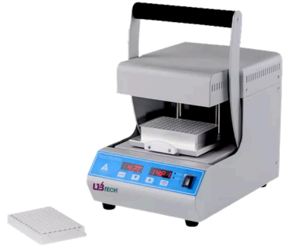
Model : UPS-M200