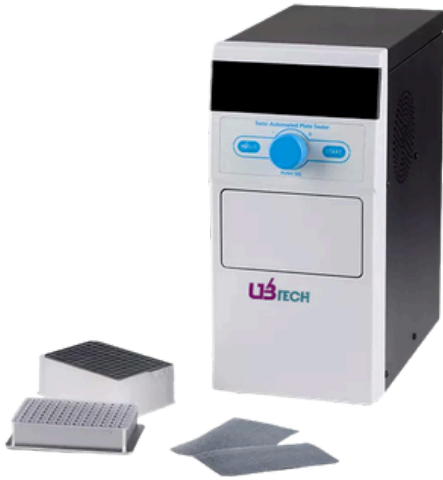
Model : UPS-SA1000