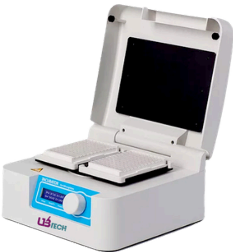
Model : UMPI-400