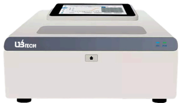
Model : UPCR-IAF164; UPCR-IAF164I

Isothermal Amplification Fluorescence PCR Detection System