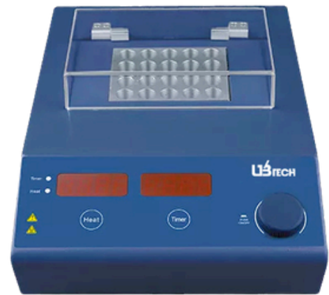
Model : UDB-105S1; UDB-105S2; UDB-150S1; UDB-150S2