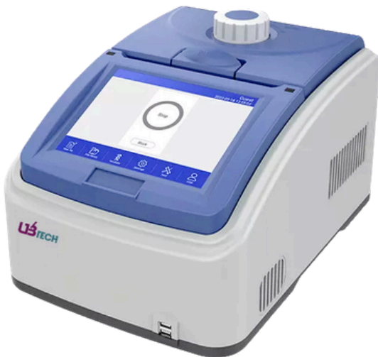
Model : UPCR-TC96S