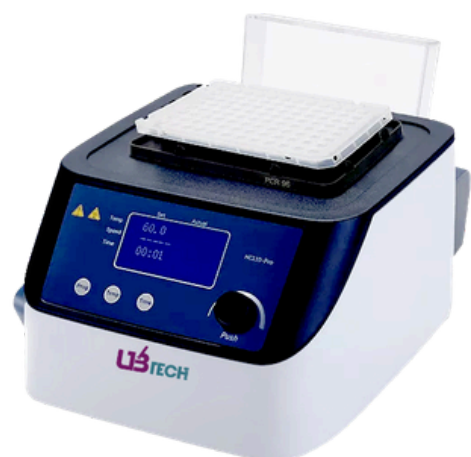
Model : UDB-HC110

Dry Bath with Heating & Cooling & Mixing