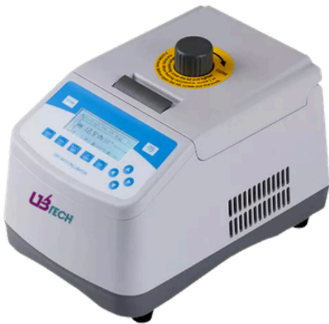
Model : UDB-H1000