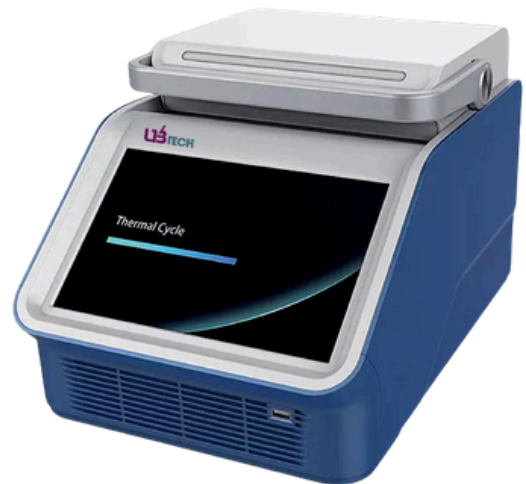
Model : UPCR-TC96A