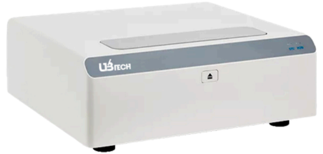
Model : UPCR-RFQ164I; UPCR-RFQ164II