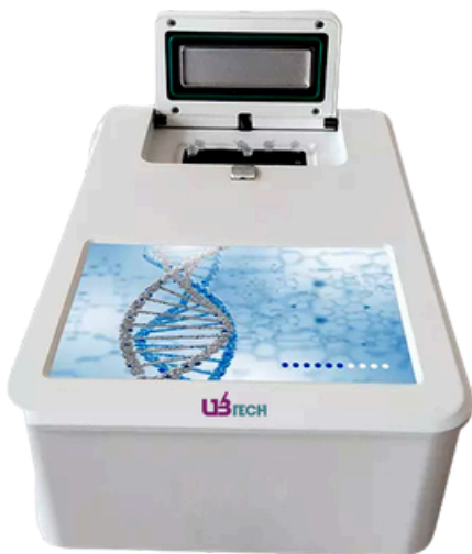
Model : UPCR-IAF16; UPCR-IAF16I

Isothermal Amplification Fluorescence PCR Detection System