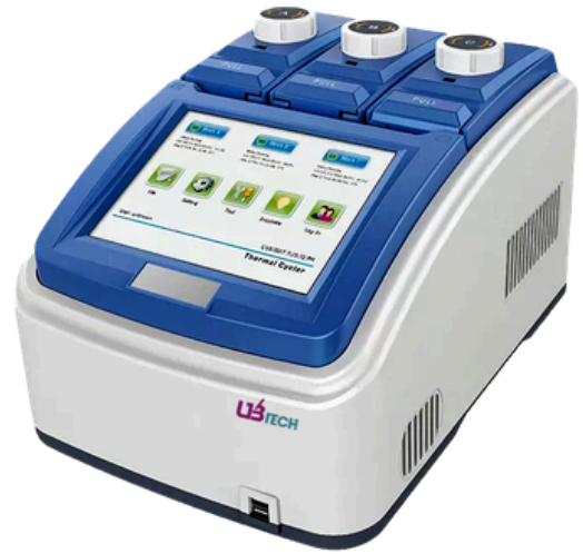
Model : UPCR-TC96XG

Thermal Cycler, Independent Temp Control Sensors