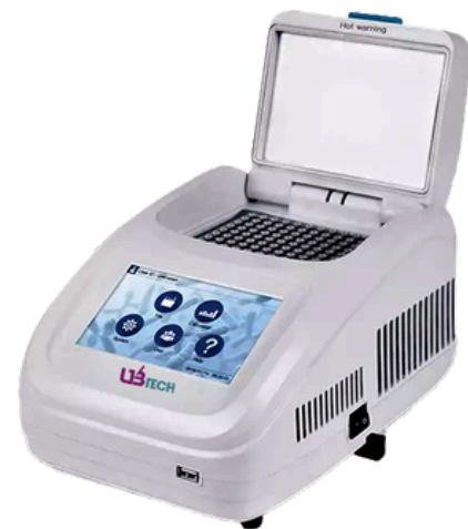
Model : UPCR-TC96E