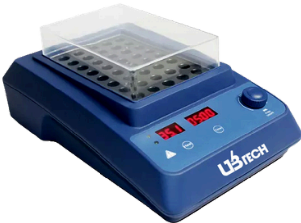
Model : UDB-60