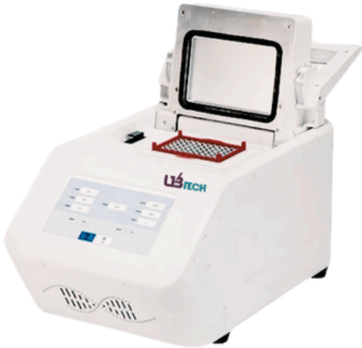
Model : UPCR-TC2100