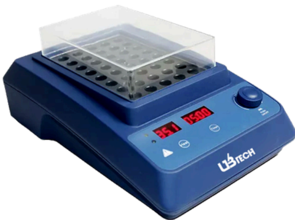
Model : UDB-120S