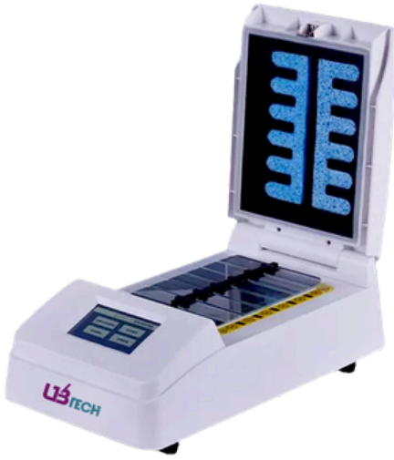
Model : UHYI-2000