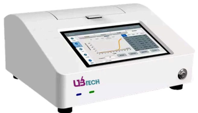
Model : UPCR-RFQ84

Real-time Fluorescence Quantitative PCR Detection System, URFQ16 Series