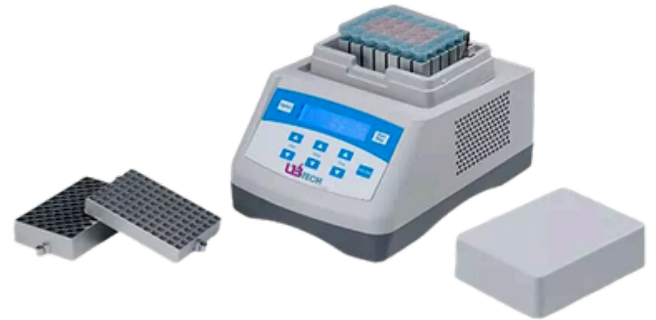
Model : UDBI-300; UDBI-10