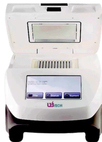
Model : UPCR-TCG