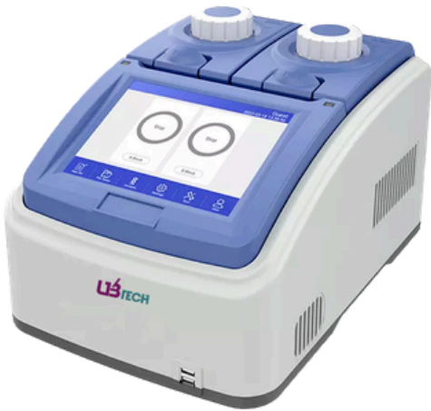
Model : UPCR-TC4852T

Thermal Cycler, Independent Temp Control Sensors