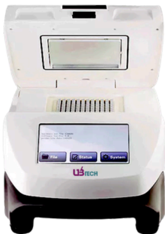
Model : UPCR-TCS

Thermal Cycler, Block/Tube Temp. Control