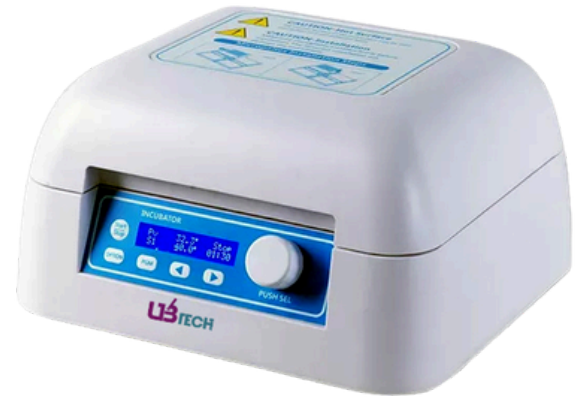
Model : UMPI-500