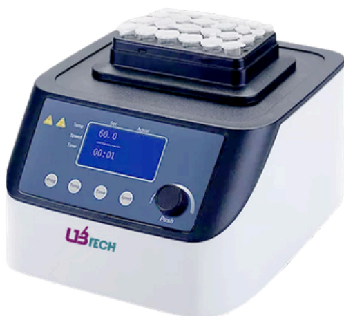
Model : UDB-HCM100; UDB-HM100; UDB-H100

Dry Bath with Heating & Cooling & Mixing