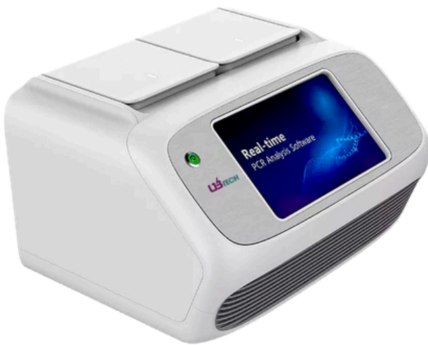
Model : UPCR-RFQ161; UPCR-RFQ164

Our PCR solutions are engineered to meet the demanding requirements of clinical diagnostics, biotechnology research, pharmaceutical development, and academic laboratories.