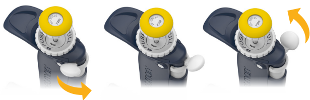
Adjustable Tip Ejector

Four PIPETMAN L multichannel models (product description ending with VR), covering a volume range from 20 µL to 300 µL, are equipped with V-rings at the bottom of the tip holders for a proper fit with most tip brands.